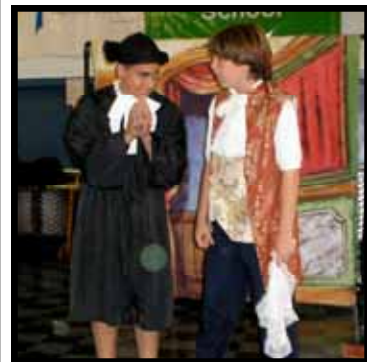
Students worked with San Francisco Opera performers in a recent production at the school.