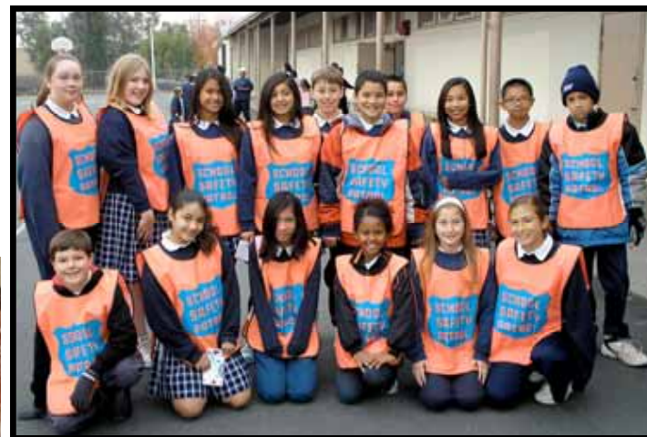
The sixth grade safety patrol ensures the safety of our students as they walk to church.