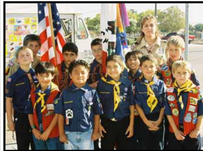
Cubs Scouts (Pack 98) from St. Peter Martyr School participate in various projects throughout the year.