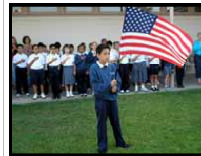
The SPM school community gathers weekly to pray, sing, honor students, and build community.