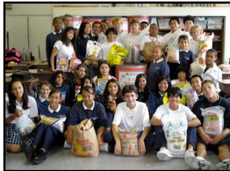
Students recently participated in a canned food drive, raising nearly four tons of food in just over two weeks.