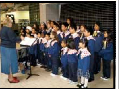
Students participate in civic and community life, too. Students recently sang for the community Christmas Tree lighting ceremony as well as a local mall.