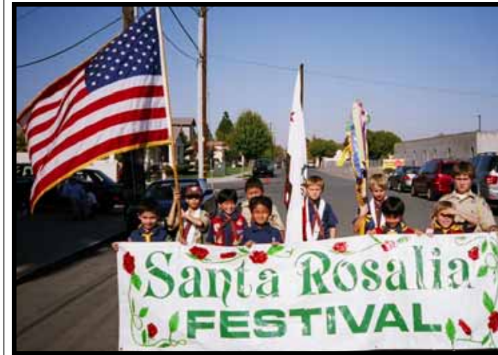
Students participate in parish life through the Santa Rosalia Festival, dramatic presentation of Our Lady of Guadalupe, and various liturgical ministries.