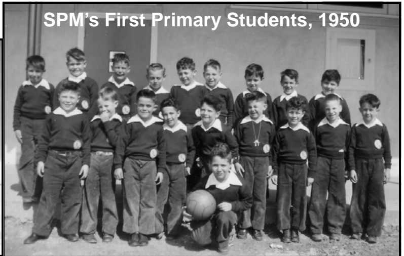
SPM's First Primary Students, 1950