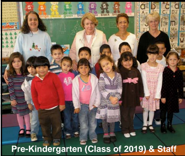
Pre-Kindergarten (Class of 2019) & Staff