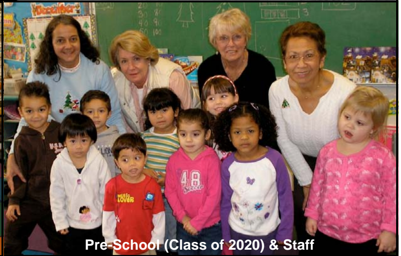
Pre-School (Class of 2020) & Staff