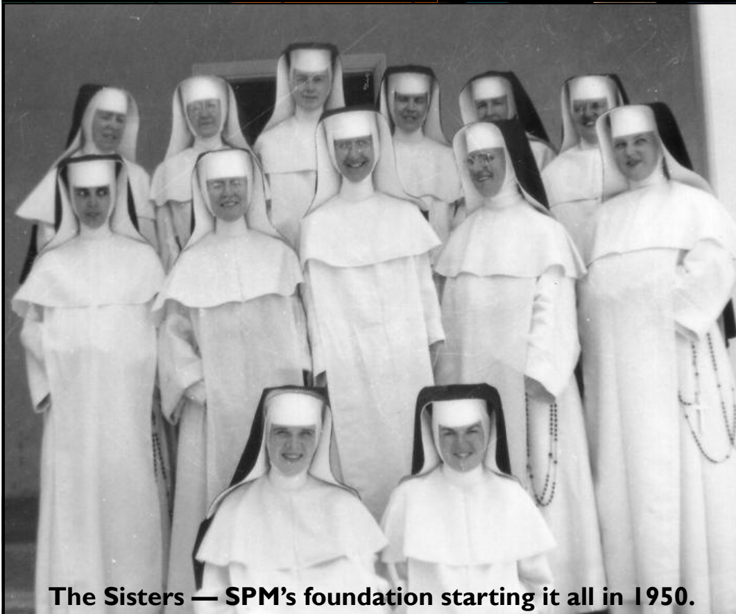
The Sisters — SPM's foundation starting it all in 1950.